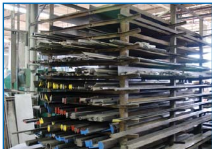
PARTIAL VIEW OF PRESS BRAKE TOOLING