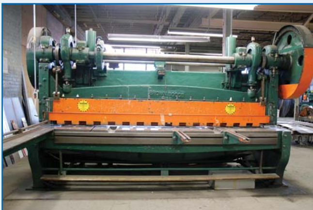
BROWN BOGGS 10' X 3/16" SHEAR, MODEL 6125