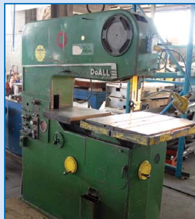
DOALL BANDSAW MODEL DBW 10