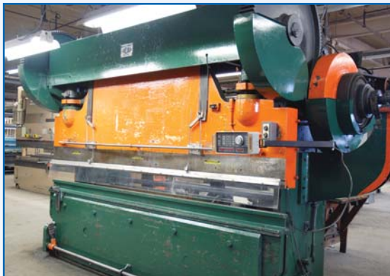
CHICAGO 12' X 225 TON MECHANICAL PRESS BRAKE, MODEL 510D