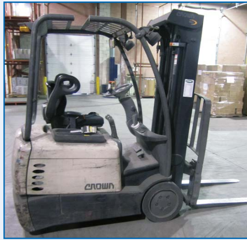
CROWN 2,550 LB CAP. ELECTRIC NARROW AISLE FORKLIFT, MODEL SC4020-30