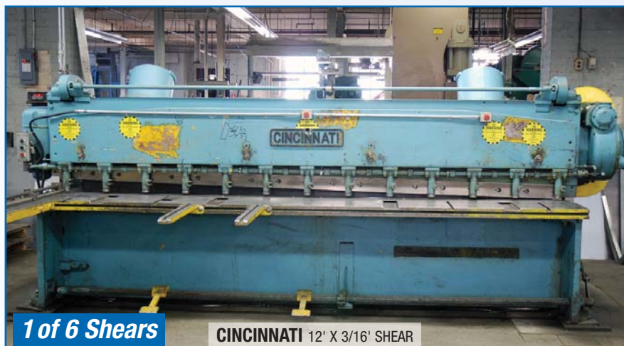
1 of 6 Shears