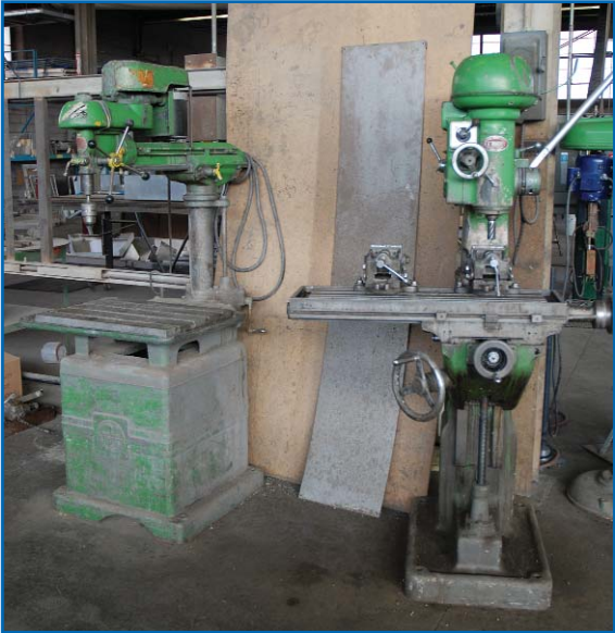
2 WALKER TURNER MILLS