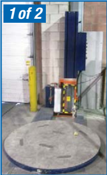
1 of 2