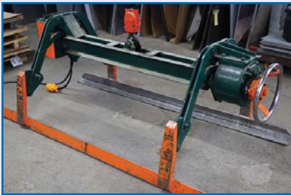
CULLEN 6,000 LB CAPACITY SHEET LIFTER