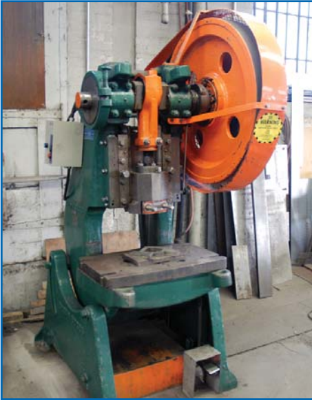
BROWN BOGGS 15L OBI PRESS, 40 TON