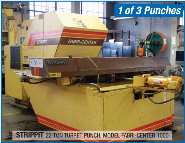
1 of 3 Punches