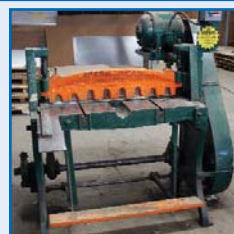
BROWN BOGGS 36" X 16 GAUGE CAPACITY POWER SHEAR