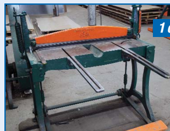
1 of 2