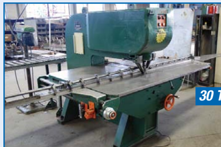
30 Ton Capacity