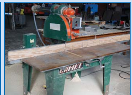
COMET RADIAL ARM SAW, MODEL CLIPPER CLC