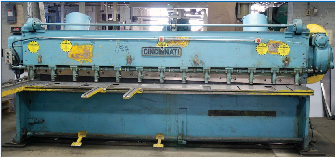
CINCINNATI 12' X 3/16" SHEAR