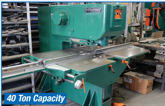
40 Ton Capacity