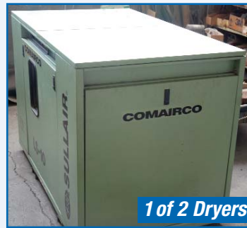
1 of 2 Dryers