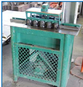
LOCKFORMER 22 GAUGE ROLL FORMER