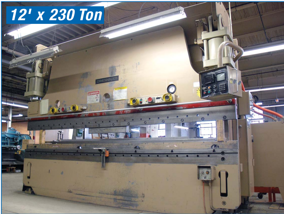
CINCINNATI 12' X 230 TON PRESS BRAKE