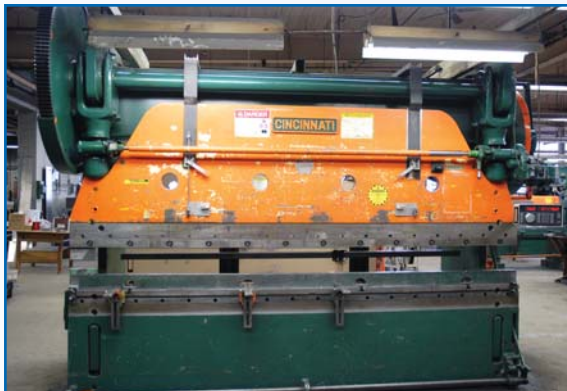
CINCINNATI 12' X 150 TON MECHANICAL PRESS BRAKE, 9 SERIES