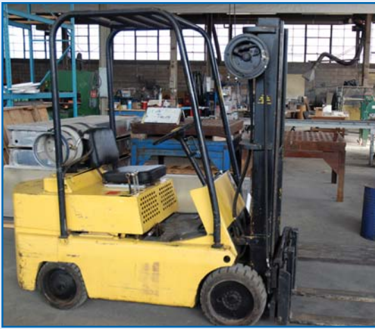
BAKER 5,000 LB CAP. PROPANE FORKLIFT MODEL FMD-050