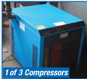
1 of 3 Compressors