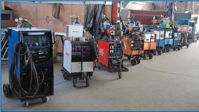
PARTIAL VIEW OF 16 ASSORTED WELDERS, PLASMA CUTTERS, STUD WELDERS