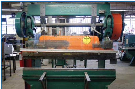
VERSON 6' X 45 TON MECHANICAL PRESS BRAKE