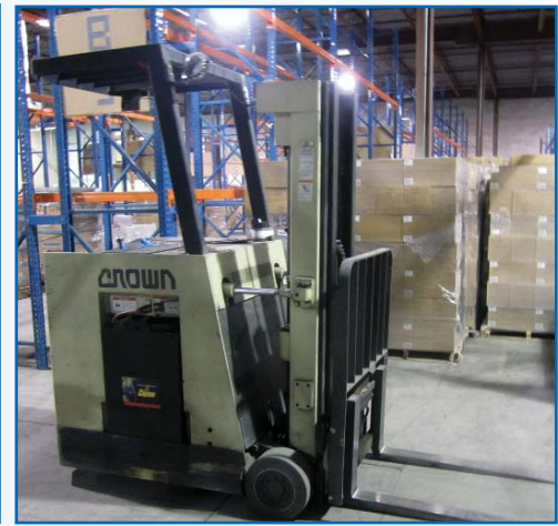
CROWN 3,000 LB CAP. REACH TRUCK MODEL 30RCTT-190