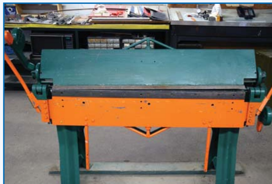
BROWN BOGGS 4' X 16 GAUGE MANUAL BRAKE