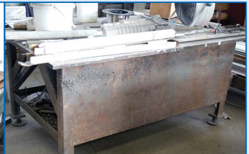
PARTIAL VIEW OF ASSORTED HEAVY DUTY WORK TABLES