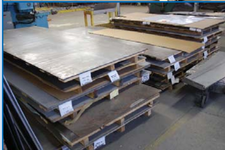
PARTIAL VIEW OF ASSORTED RAW MATERIALS